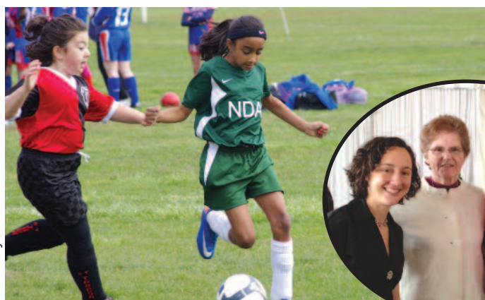
Elementary School soccer

principals of the Elementary and High Schools are alumnae of the Academy. Several faculty members in both schools are alums. Each teacher is immersed in our philosophy of Liberating Education. And so 110 years later we still have “No doubt that our great efforts will attract from heaven to our little corner of the earth, the graces which would permit us to do ‘As Much Good as God Allows’”. 🌸