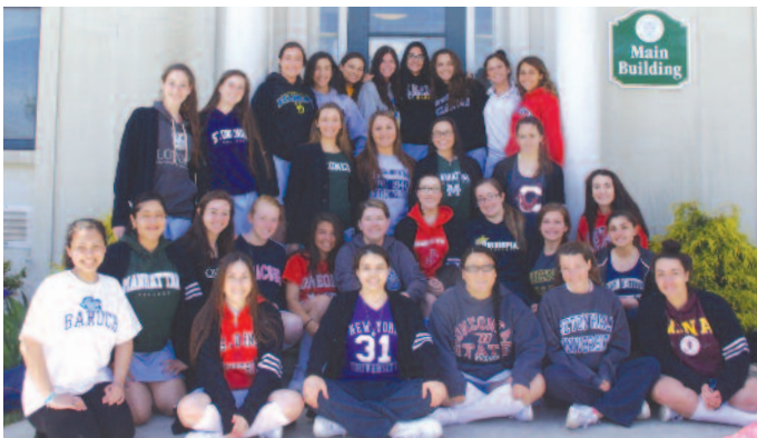
High School graduates in their College Sweatshirts

Many things will continue to change. Our hope is that we can preserve that pioneer spirit that marked the beginning of Notre Dame and continued throughout the previous century and into this one. While just three CND Sisters remain at the Academy there is a strong sense that the founding spirit remains. The