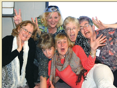
Enthusiastic Rhode Island Associates at the Assembly

Exceeding our expectations, 48 Associates from all our U.S. communities responded to The Call to Visitation: The Associate Relationship, Past, Present and Future.