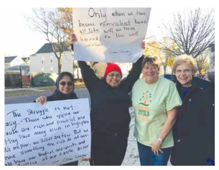
Associates rally for immigrant youth in the Back of the Yards section of Chicago.

Associates beginning a prayer shawl ministry for women of Holy Cross - Immaculate Heart of Mary Parish, Chicago.