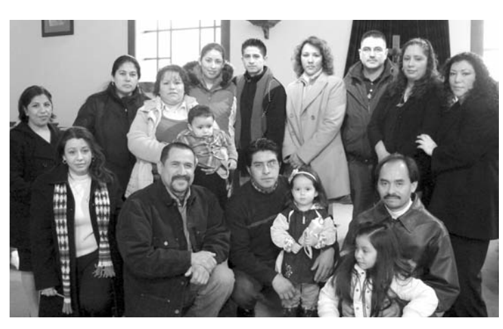
Adult formation at St. Teresa's Church in Kankakee is a family affair.