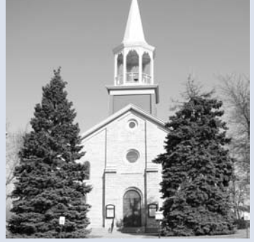
Maternity of the Blessed Virgin Mary, Bourbonnais, IL