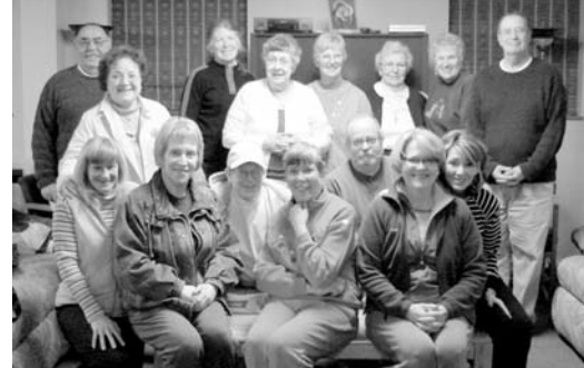
Lenten reflection groups not only nourish the faith of individual parishioners but the life of the larger community as well.