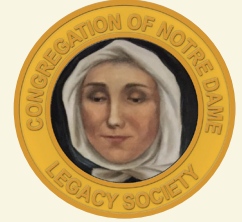
St. Marguerite Bourgeoys Legacy Society Pin