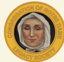
St. Marguerite Bourgeoys Legacy Society Pin