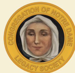
St. Marguerite Bourgeoys Legacy Society pin